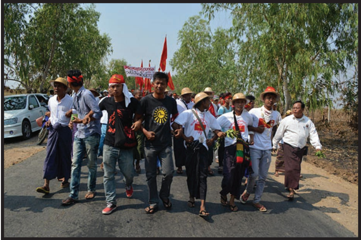
Students protest against the National Education Law between Bago and Magwe Region

after I was released from prison. Actually, it was the [Burma] Government's plan to cause my family trouble."