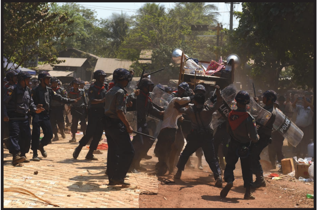
A student hit by police in Latpadan on 10 March 2015

Section 1 of the Report – the Introduction – explains the background to the issue of HRDs in Burma, and outlines the current political situation in the country. In brief, since early 2011, when President Thein Sein’s quasi-civilian government came to power, Burma has undergone a series of reforms that gave many hope that the situation of HRDs would improve – in terms of their freedom to pursue their valuable and legitimate human rights work. However, testimony and reports from inside the country paint a very different picture and, as the 2015 national elections draw ever closer, the democratic and civil society space within which HRDs can operate has started to contract alarmingly once again. Those who try to defend human rights now seem to be operating in as dangerous environment as ever.