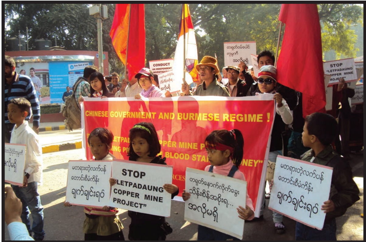
Protest against the Letpadaung copper mine project

unjust and prejudiced charges, and illegal and arbitrary detention, 57 which fundamentally undermined her ability to conduct her legitimate and valuable human rights work.