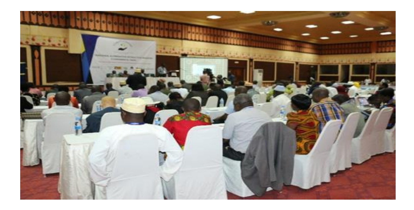
Fig. 3 a segment of participants during the Tanzania

Regarding 0.3% paid to the Local Governments from the mining companies there is no any systematic way to calculate the payment as the exact income generated from the industry is only known to the company.