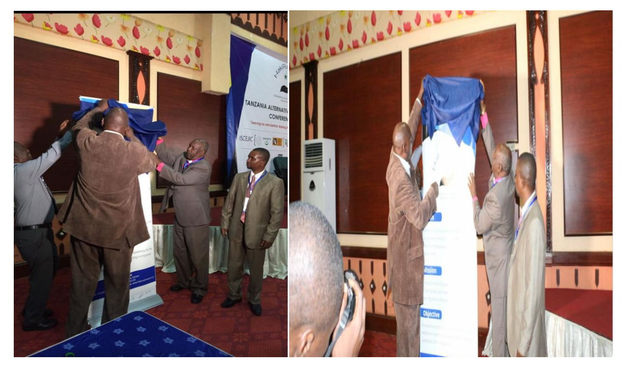
Fig.2 Unveiling o of HakiRasilimali platform by Tanzania deputy Commissioner for minerals

After his speech the Guest of Honor officially opened the conference and launced the HakiRasilimali Platform.