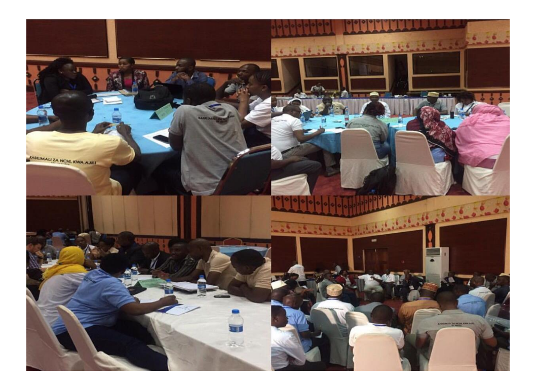
Fig 4. Four thematic workshops during the conference