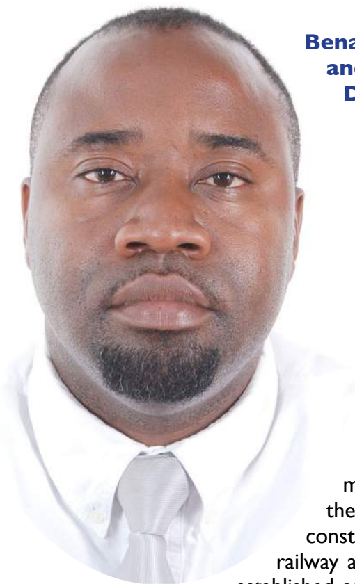
Benard Mujuni: Commissioner Department of Equity and Rights, Ministry of Gender, Labour and Social Development

E nhancing the effective participation of communities in development processes and promoting rights, gender equality and women's empowerment in development processes are two of the key strategic objectives of the Ministry of Gender, Labour and Social Development. The Ministry is also charged with the responsibility of guiding interventions related to the protection of vulnerable and marginalized individuals and groups.