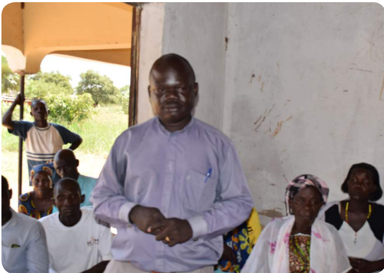
An opinion leader from Buliisa District speaks out on land matters and issues of compensation in the oil rich District.

For businesses, mere compliance with national laws is inadequate. The UNGPs call for respect of, at minimum 7 , internationally recognized human rights –those under the International Bill of Human Rights 8 and the principles concerning fundamental rights set out in the International Labour Organization’s Declaration on Fundamental Principles and Rights at Work. 9