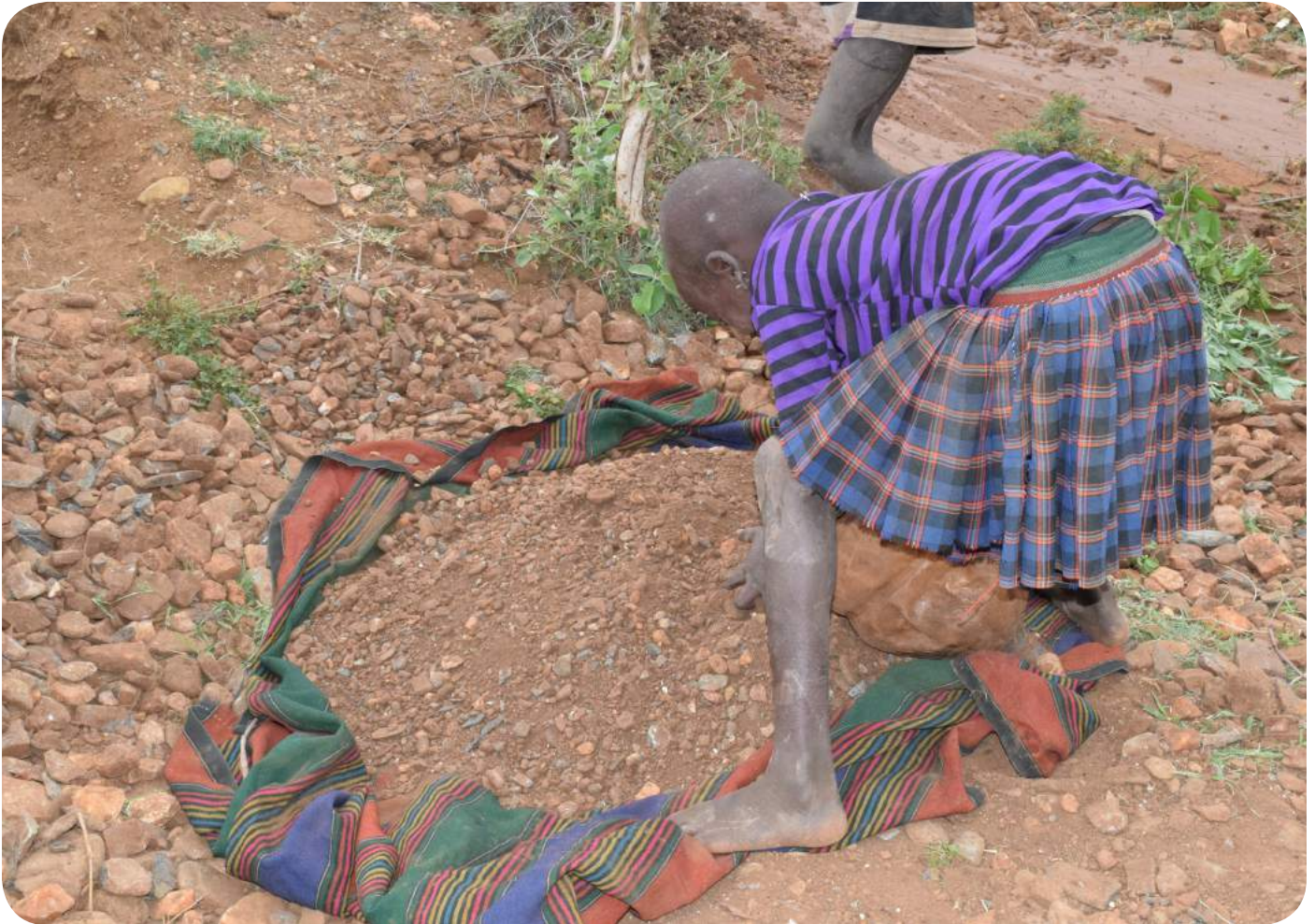
A child in Moroto District searches for gold. The need to boost household income has escalated cases of child labour

Business and Human Rights Resource Centre's website: http://business-humanrights.org/en/un-guiding-principles/implementation-tools-examples/implementation-by-governments/by-type-of-initiative/national-action-plans