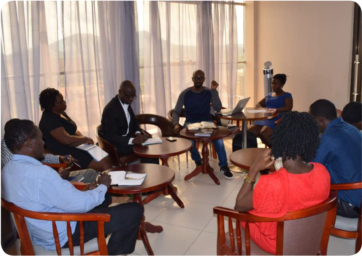
UCCA Coordinator engaging with CSOs in the Albertine region on issues of corporate accountability.

remain predominantly unenforced. According to the 2016 report of the Uganda Consortium on Corporate Accountability entitled “The State of Corporate Accountability in Uganda,” most working conditions in the informal sector, in particular within the informal mining sector, are hazardous and grueling—in some instances verging on modern day slavery.