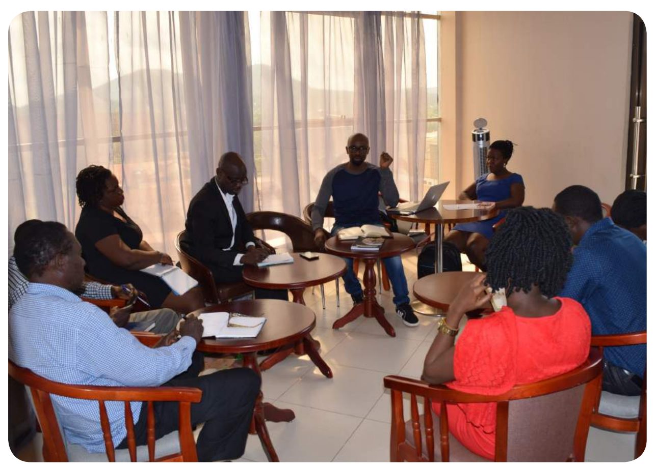
UCCA Coordinator engaging with CSOs in the Albertine region on issues of corporate accountability.

remain predominantly unenforced. According to the 2016 report of the Uganda Consortium on Corporate Accountability entitled "The State of Corporate Accountability in Uganda," most working conditions in the informal sector, in particular within the informal mining sector, are hazardous and grueling —in some instances verging on modern day slavery.