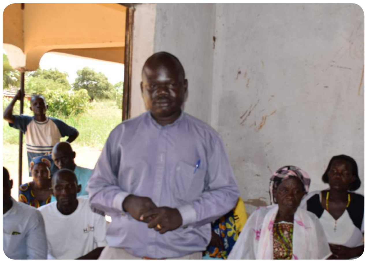
An opinion leader from Buliisa District speaks out on land matters and issues of compensation in the oil rich District.

For businesses, mere compliance with national laws is inadequate. The UNGPs call for respect of, at minimum<sup>7</sup>, internationally recognized human rights –those under the International Bill of Human Rights<sup>8</sup> and the principles concerning fundamental rights set out in the International Labour Organization's Declaration on Fundamental Principles and Rights at Work.<sup>9</sup>