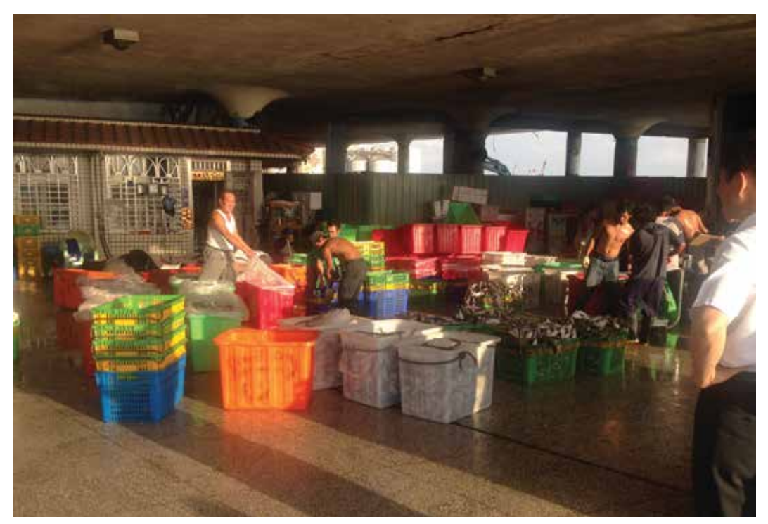
Migrant workers sorting seafood.