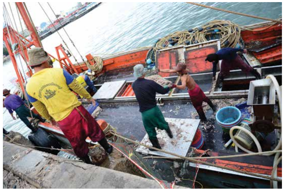
Workers on a seafood vessel in Thailand

ICCR staff and ICCR member Robeco and other investors involved with UN Principles on Responsible Investment's Labor Standards Working Group, engaged the company on the issue requiring full disclosure of the measures it has implemented to address the allegations. The dialogue started in August 2014 to discuss risk management for the company as well as its buyers. In the fall of 2014, ICCR met with company management in Bangkok to discuss recruitment of migrant workers. At that time the company had just started to implement its ethical recruitment policy. CP Foods noted that it has taken measures to improve the traceability of its extended supply chain through a joint effort with the Thai government. The company has adopted a number of additional measures to increase the traceability of its farmed shrimp supply chain as well as to address the issues surrounding the welfare of migrant workers in its supply chain: