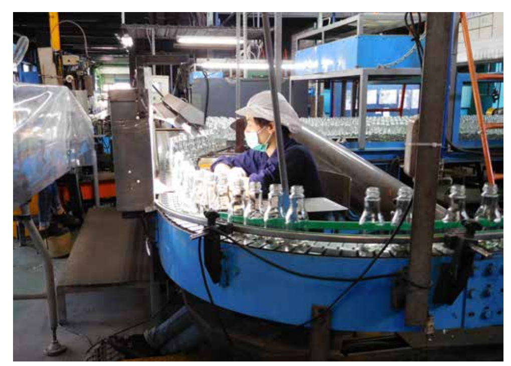
A migrant worker on a production line in a glass-blowing facility in Taiwan.

Many migrant workers experience a large financial burden not just from paying broker fees before departure and while on the job, but also from government-imposed requirements to take loans that secure their return to their home countries. Excessive government-imposed fees create enormous risks for workers: they incentivize illegal migration through unregistered brokers that bypass those government regulations, placing many vulnerable job seekers at risk for human trafficking<sup>17</sup>.