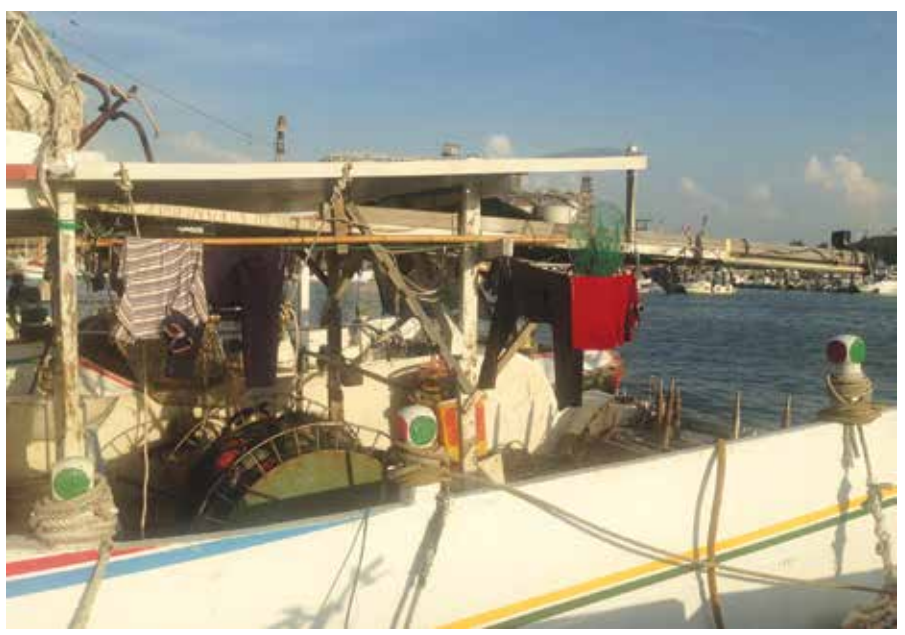
Migrant worker life on a fishing boat.

These efforts have gone hand-in-hand with the changing regulatory framework in Thailand on the issue of migrant workers. With the EU issuing yellow cards (an objection warranting a legislative review) for unregulated fishing, Thailand being downgraded to Tier 3 status (though subsequently upgraded to Tier 2) by the U.S. Department of State, and the rising media pressure, Thailand has become strongly associated with slavery in seafood supply chains. In response, Thai Union and other industry players joined the Seafood Task Force which promotes a sustainable supply chain in the Thai fishing industry. The company has launched a number of policies designed to protect its workers' human rights, and is subject to internationally-recognized external verifications and audits by third-party certification bodies working to promote standard labor practices. Working with the Seafood Task Force, suppliers and customers, Thai Union has expanded its auditing efforts to include vessels in its Thai fleet.