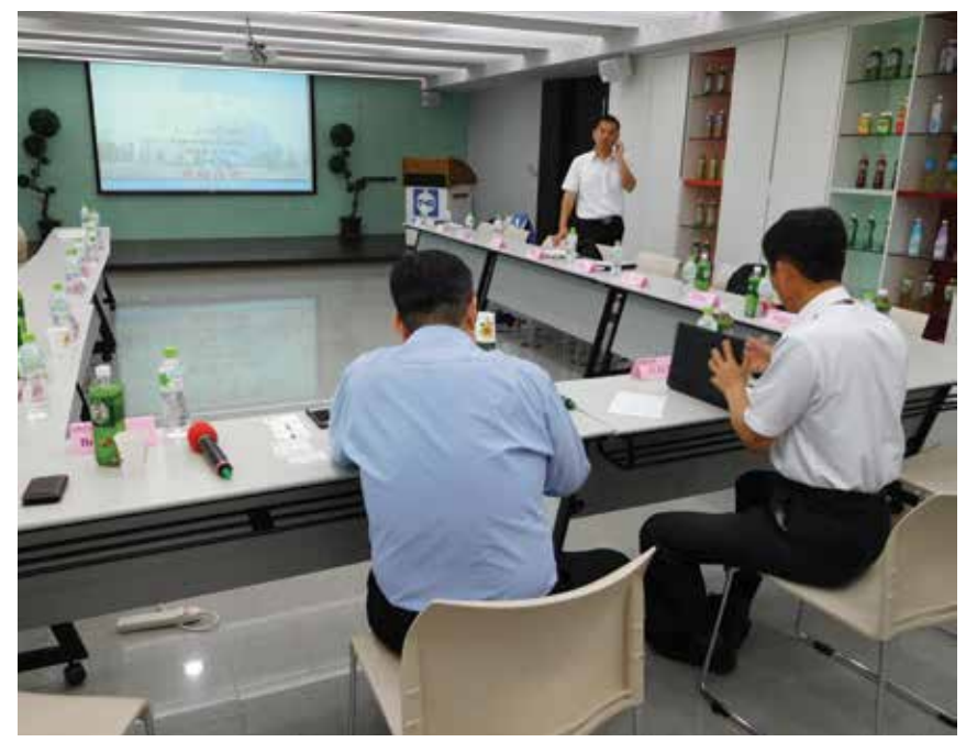
An audit in progress.

Our first case study came from collaboration with The Coca-Cola Company (TCCC) where ICCR was able to participate in a shadow audit of two suppliers in one of the company's most difficult markets, Taiwan. The issue of recruitment of migrant workers in Taiwan has been challenging for the company due to the existing legal framework, the company's minimal leverage with its suppliers, and the lack of other buyers enforcing the No Fees principle.