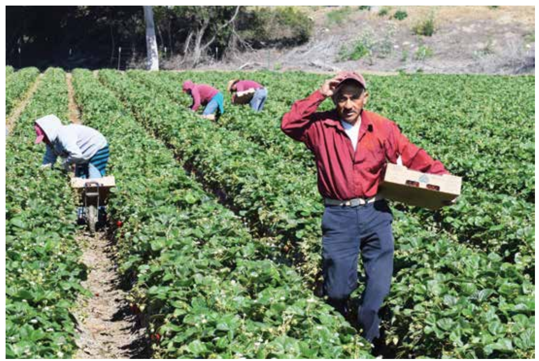
Migrant workers in the U.S. agriculture sector.